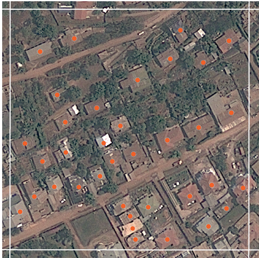
Figure 2: Low building density.