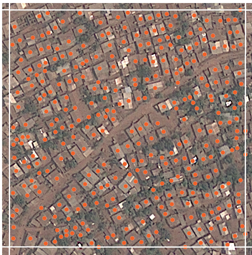
Figure 4: High building density.